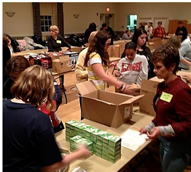
Girl Scouts and adults work together to sort toiletries.

Editor’s Note: Although this branch report is from 1985, it states many things that are still appropriate today. To continue this report for 2014, our branch collected, made, and/or purchased, and gave 52,166 new clothes, linens, and toiletries to needy neighbors in the Greater Philadelphia area. We now hold two auctions each year – one in March and one in November. Our November 2014 auction raised $6,175.21. The bake sale is now part of the auctions and a very productive part of our fund raisers. Our success continues and grows due to generous volunteers, the efforts of many from pre-school to mature citizens, prudent shoppers, and the ongoing support of the North and Southampton Reformed Church. And “we dare to imagine even greater figures.”