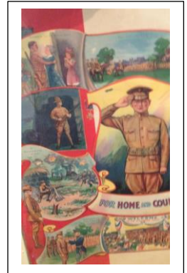
Three WWI posters showed up at the last auction. What will we find this time?