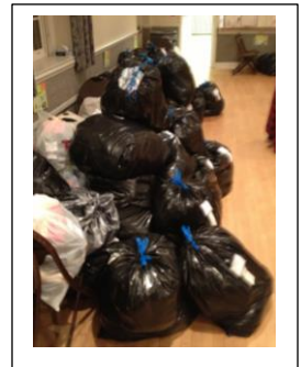
These bags of our gifts are ready for an agency pickup.